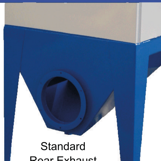
Standard Rear Exhaust